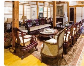
FIRST FLOOR, EXHIBITION ROOM 2

Exhibits in the main hall include the writer's hand-written manuscripts, published books, letters, notes, and awards.