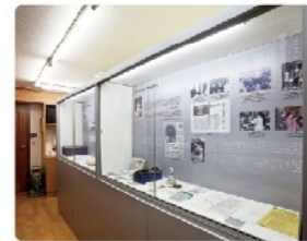
THIRD FLOOR, EXHIBITION ROOM 3

From the 1970s, HMS used this room as her bedroom and study. Three walls have built-in bookcases filled with HMS's book collection. The low table, where HMS wrote and painted, still has her writing and painting implements as well as some household items.