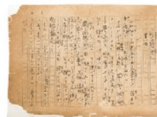
『A Woman with a Lantern』