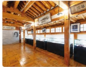
FIRST FLOOR, EXHIBITION ROOM 1

Exhibits in the main hall include the writer's hand-written manuscripts, published books, letters, notes, and awards.