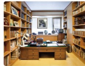
SECOND FLOOR, BEDROOM / STUDY

This was the reception room of the family where HMS frequently greeted Korean and foreign celebrities; Some of their works, which were presented to HMS as gifts, are displayed in the room.